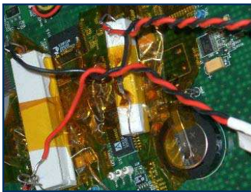
Figure 2: Power resistors are applied to a suspect circuit

Note: In both of these examples, only the location of the failure has been identified. The cause of failure must be determined before deciding upon an appropriate course of action. The combination of testing, monitoring, fault isolation and effective debug information will, in most cases, lead to the root cause of the failure. Once the root cause is determined, the fault is analysed and an appropriate corrective action implemented allowing the testing to continue.