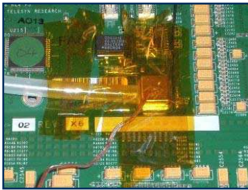
Figure 1: Freeze spray is applied to a suspect component

Note: During the application of thermal isolation it is important to monitor the temperature of the component or circuit using a thermocouple or similar device.